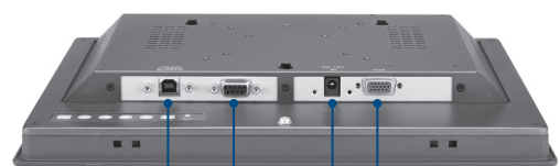
Touch Screen (USB) Touch Screen (RS-232) DC Jack 12V DC (100-240V AC adapter included) VGA Port