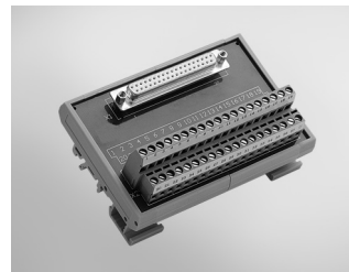
ADAM-3937 DB37 DIN-rail Wiring Board