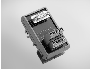
ADAM-3909 DB9 DIN-rail Wiring Board