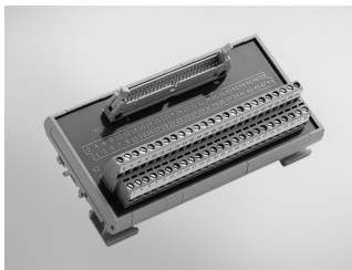
ADAM-3950 50-pin DIN-rail Flat Cable Wiring Board

PCI-1713U, PCI-1715U, PCI-1718HDU, PCI-1720U, PCI-1730U, PCI-1733, PCI-1734, PCI-1750, PCI-1760U, PCI-1761