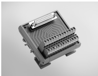
ADAM-3925 DB25 DIN-rail Wiring Board

PCI-1735U, PCL-711B, PCL-720+, PCL-726, PCL-727, PCL-730, PCL-812PG, PCL-816, PCL-818 Series, PCL-836